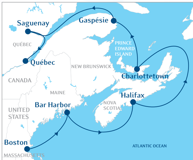
Québec–Boston, one-way trip (round trip also available)