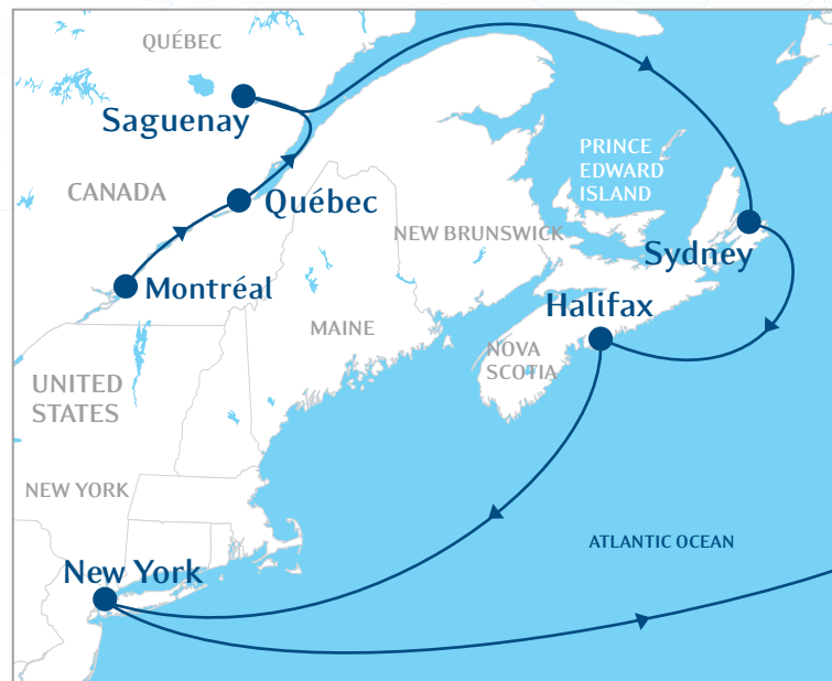
Transatlantic, from/to Europe