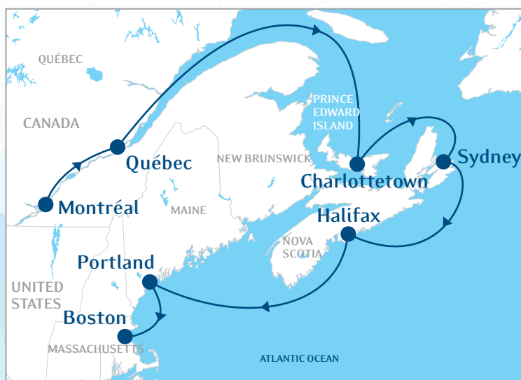
Montréal–Boston, one-way trip (round trip also available)