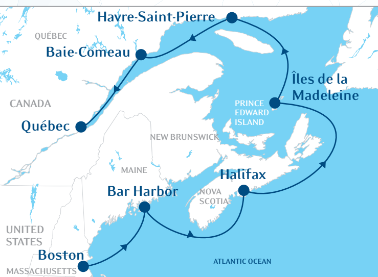
Boston–Québec, one-way trip (round trip also available)